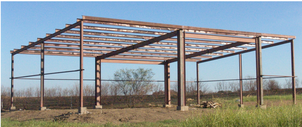
First stage of construction of the Service Center

our storage space. It will also include an office. We need to pour a concrete floor in it this fall and get some steel on the sides and roof. Total budget for the remaining work is $20,000. If you would like to see your name on the building, that amount will make it happen. We should have this building open and operating by the end of the year, but certainly in time for our wall update June 4, 2011.