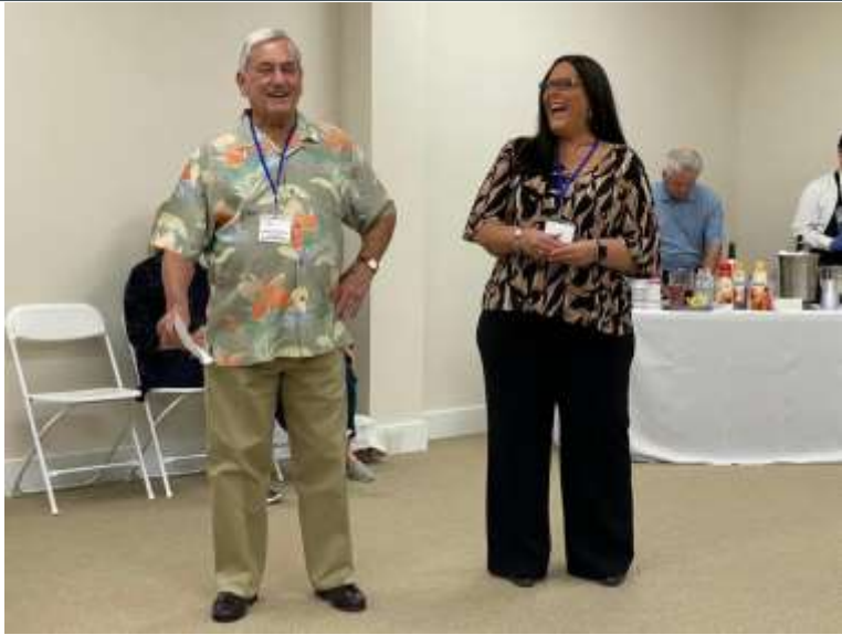
2022 Grand Opening Breakfast