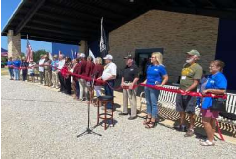
Grand Opening Day