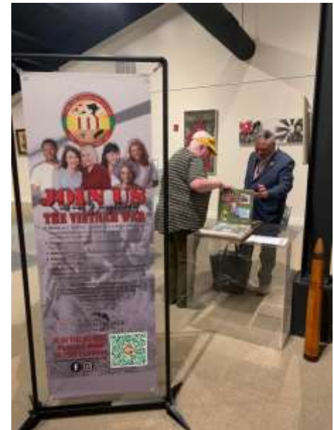
The Sons & Daughters at the Museum